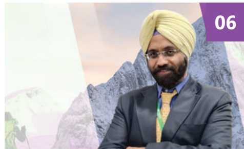
Know Your Colleague