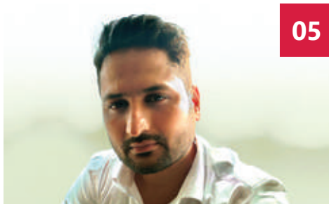
The Other Side