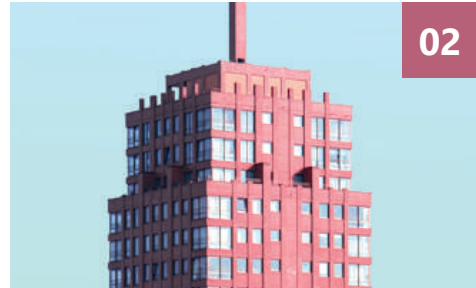
New Business Acquisition