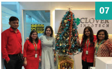
Cloverites in Action